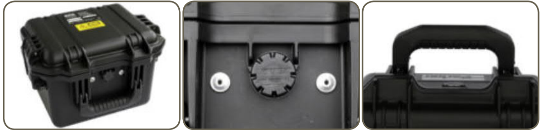
Durable HPX® case

This mineral or aviation fuel based fluid contamination detector is designed for use in adverse conditions and is housed in an HPX® High Performance Resin case. With its Vortex® valve allowing pressure release without letting in water and its soft handle, icountOS has been designed with customers in mind, offering durability, functionality and future customisation options.