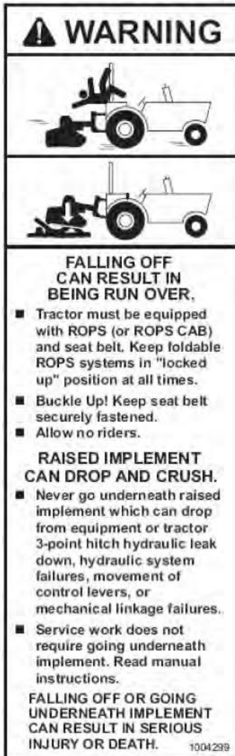
Qty 1 - Falling Off Warning Decal 3" x 10"