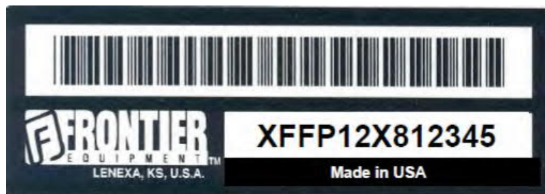
Qty 1 – Serial Number Decal

Replace decals immediately if damaged or worn.