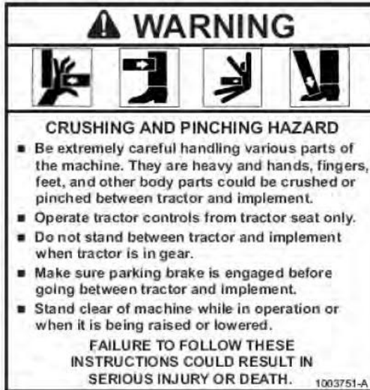
Qty 1 - To Avoid Serious Injury or Death Warning Decal 4.5" x 4.5"