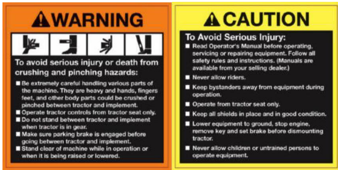
Qty 1 – Crush/Pinch Warning Decal