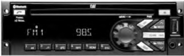
Illustration 2 g03566527 MP3/USB/iPod/Aux/Bluetooth/CD Receiver