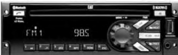
Illustration 3 g03566571 MP3/USB/iPod/Aux/Bluetooth/CD/SAT Receiver