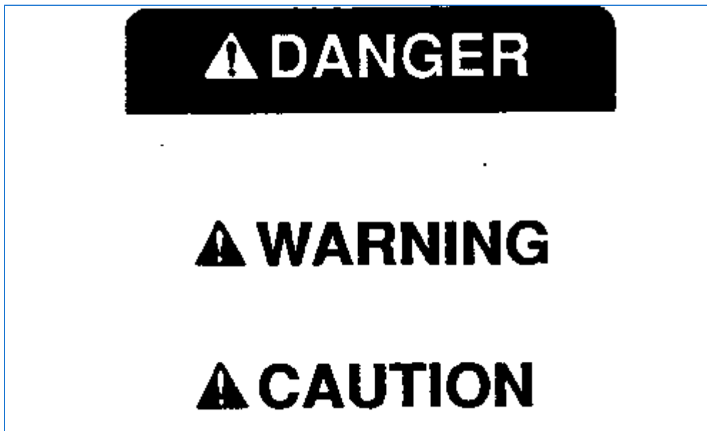
TS187-19: Signal Words

A signal word—DANGER, WARNING, or CAUTION—is used with the safety-alert symbol. DANGER identifies the most serious hazards.