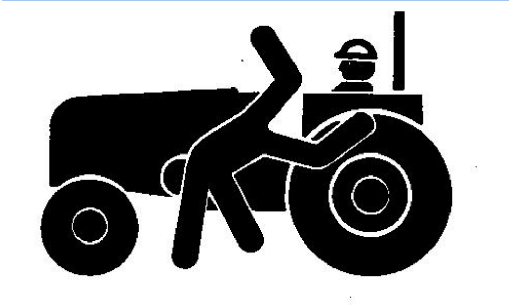
TS213-UN: Stay Clear of Moving Tractor

Always place transmission in PARK before dismounting. Leaving transmission in gear with engine stopped will NOT prevent the tractor from moving.