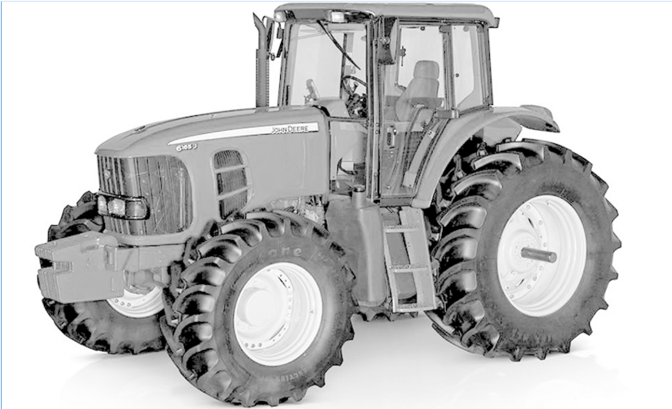
YHA000102-UN: 6165J and 6185J Tractors