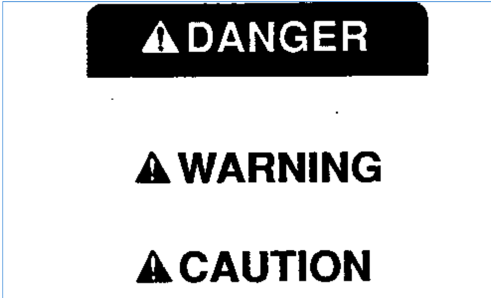
TS187-19: Signal Words

A signal word—DANGER, WARNING, or CAUTION—is used with the safety-alert symbol. DANGER identifies the most serious hazards.