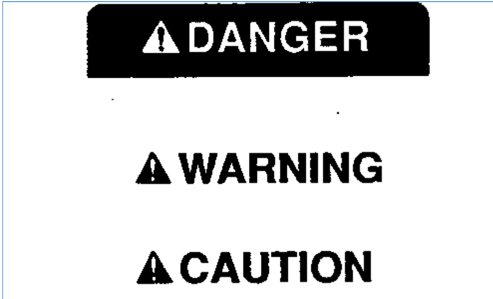
TS187-19: Signal Words

A signal word—DANGER, WARNING, or CAUTION—is used with the safety-alert symbol. DANGER identifies the most serious hazards.