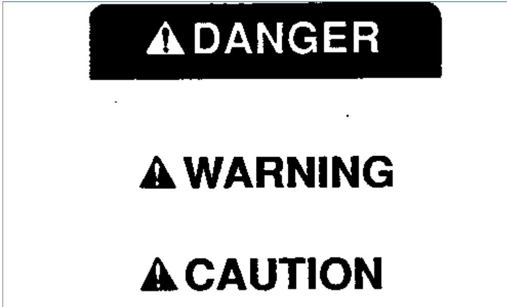
TS187-19: Signal Words

A signal word—DANGER, WARNING, or CAUTION—is used with the safety-alert symbol. DANGER identifies the most serious hazards.