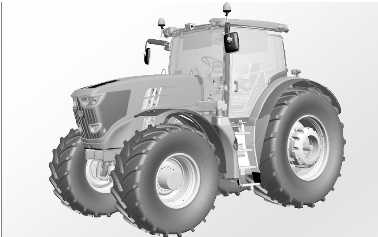
LX203985-UN: Tractor Shown with Additional Equipment