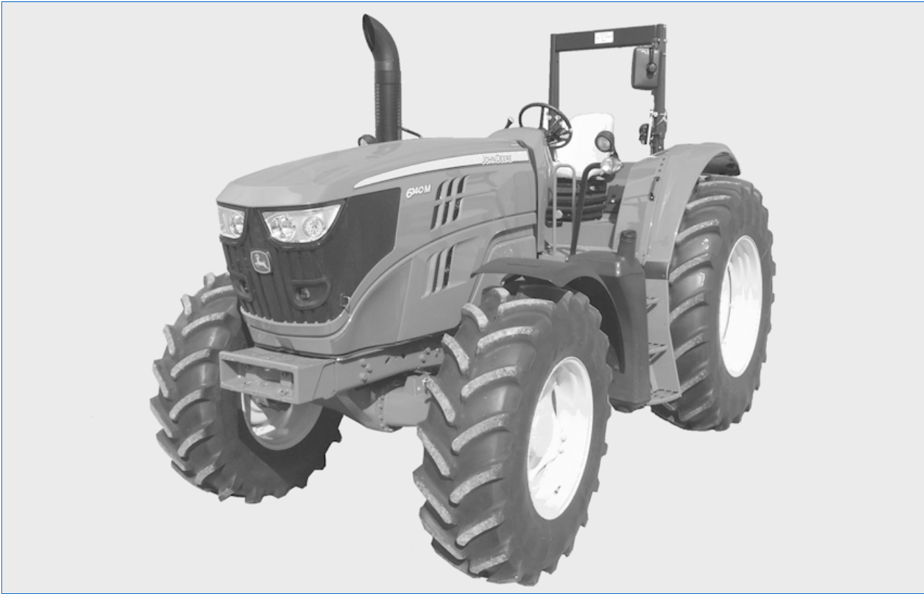
LX1056621-UN: Tractor shown with optional equipment