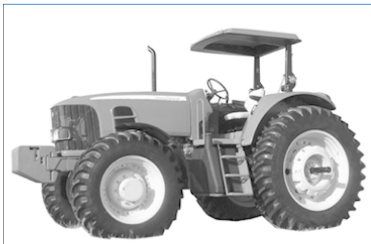
P16053-UN: 6140J MFWD Tractor