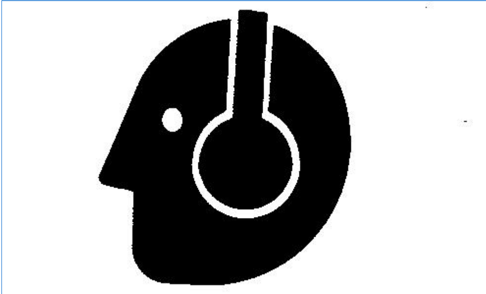
TS207-UN: Noise Exposure

Prolonged exposure to loud noise can cause impairment or loss of hearing.