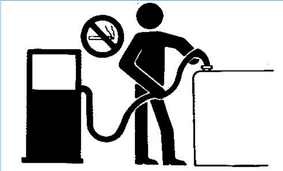
TS202-UN: Avoid Fires

Handle fuel with care: it is highly flammable. Do not refuel the machine while smoking or when near open flame or sparks.