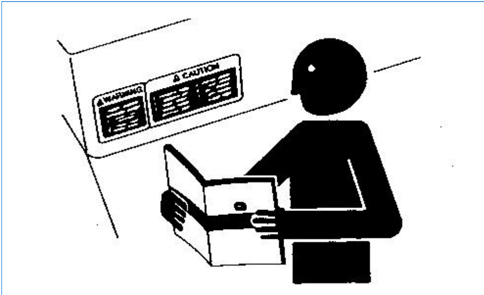
TS201-UN: Safety Messages

Carefully read all safety messages in this manual and on your machine safety signs. Keep safety signs in good condition. Replace missing or damaged safety signs. Be sure new equipment components and repair parts include the current safety signs. Replacement safety signs are available from your John Deere dealer.