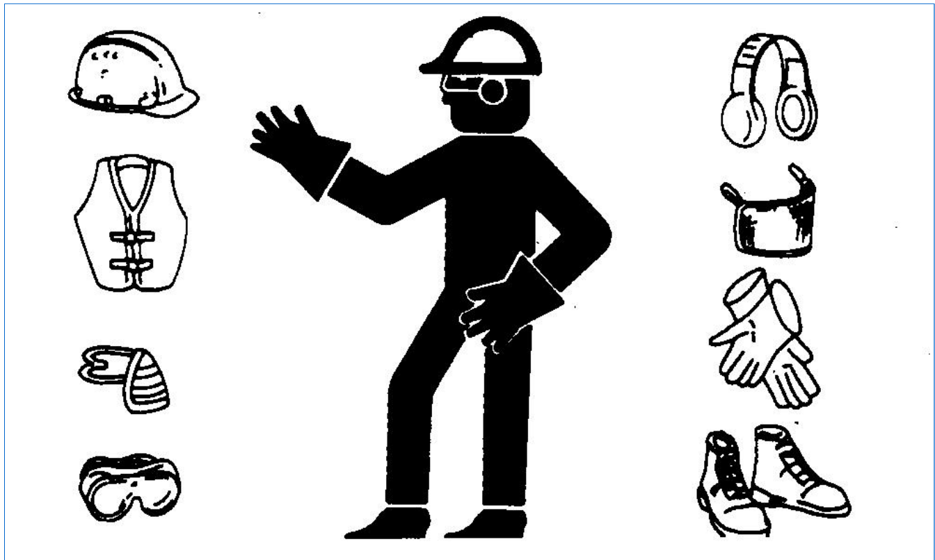
TS206-UN: Protective Clothing

Wear close fitting clothing and safety equipment appropriate to the job.