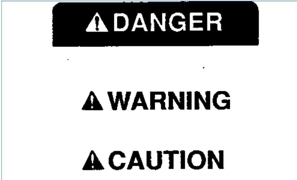
TS187-19: Signal Words

A signal word—DANGER, WARNING, or CAUTION—is used with the safety-alert symbol. DANGER identifies the most serious hazards.