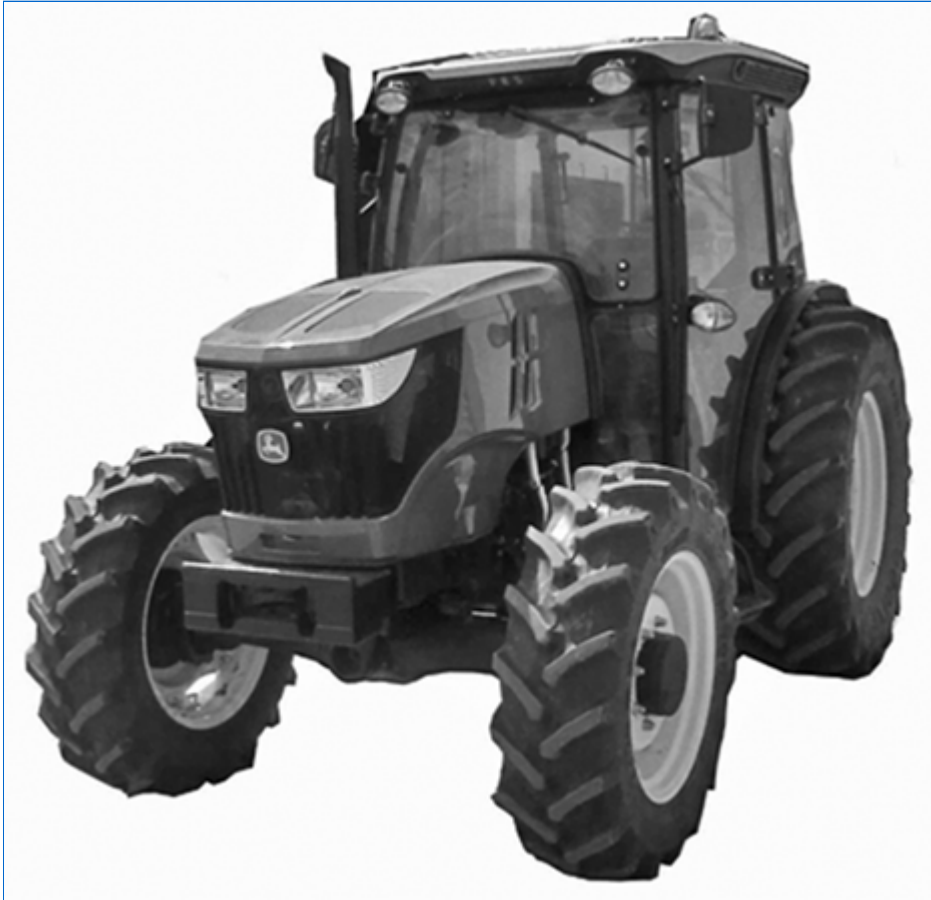
AT202537-UN: Tractor with Cab