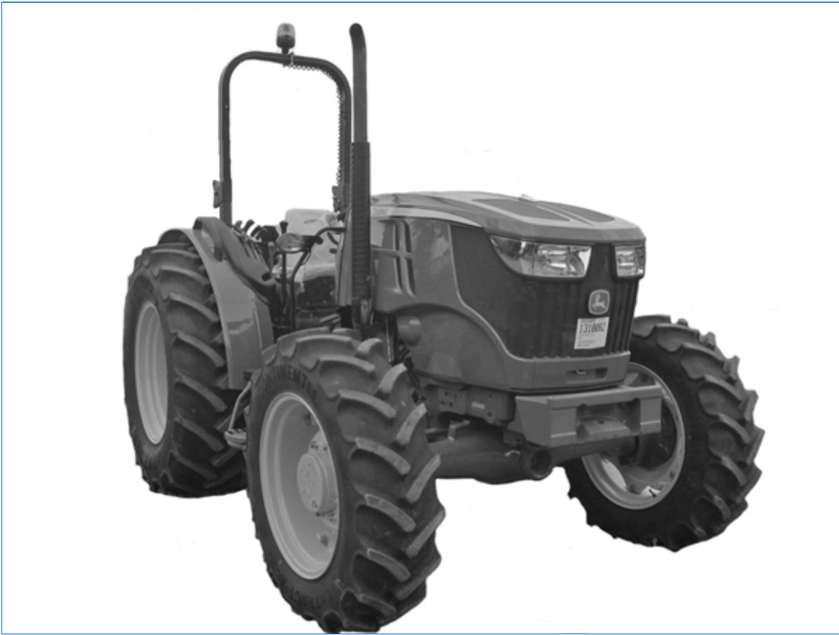
LX203962-UN: Tractor without Cab