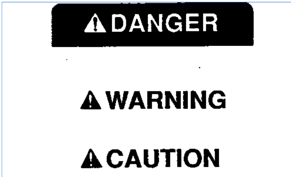
TS187-19: Signal Words

A signal word—DANGER, WARNING, or CAUTION—is used with the safety-alert symbol. DANGER identifies the most serious hazards.