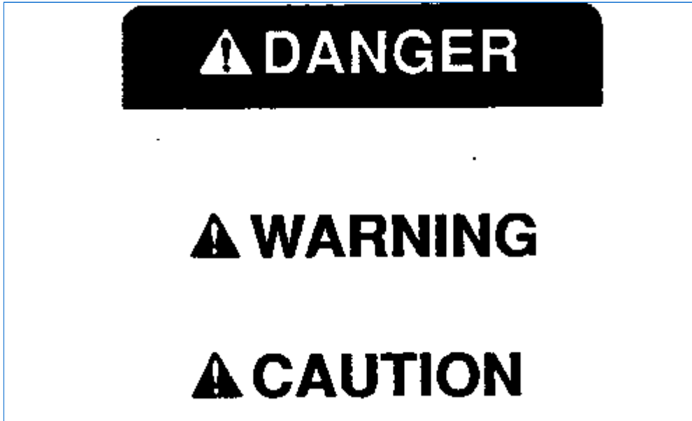
TS187-19: Signal Words

Signal words DANGER, WARNING or CAUTION are used together with safety-alert symbols. DANGER means very serious injury may occur.