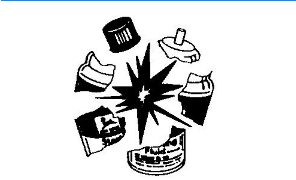
TS1356-UN: Storing Safely