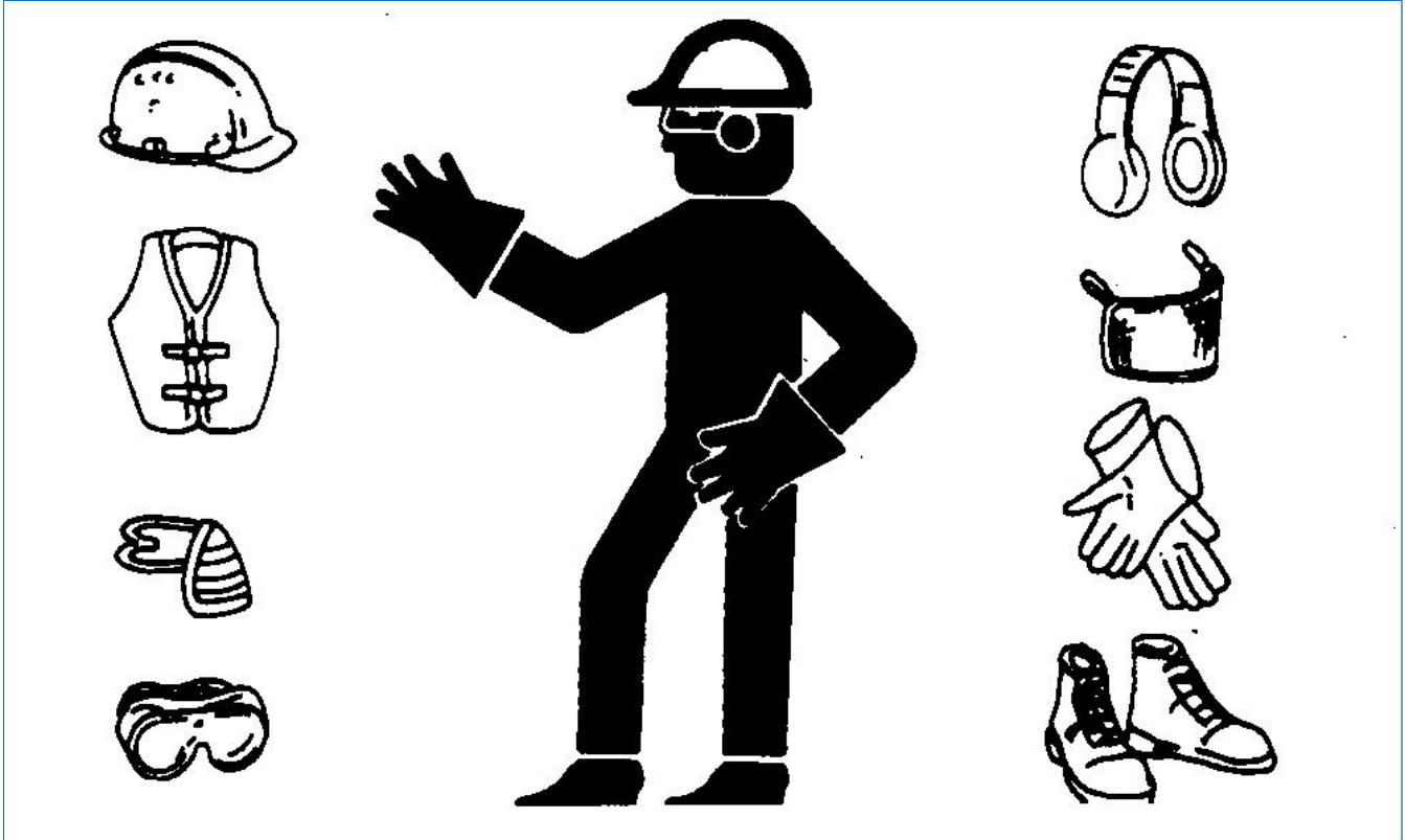
TS206-UN: Protective Clothing

Wear close fitting clothing and safety equipment appropriate to the job.