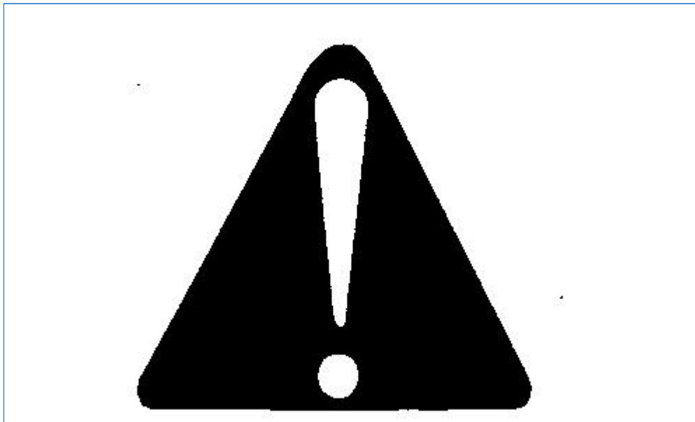
T81389-UN: Safety-alert symbol

This is a safety-alert symbol. When you see this symbol on your machine or in this manual, be alert to the potential for personal injury.