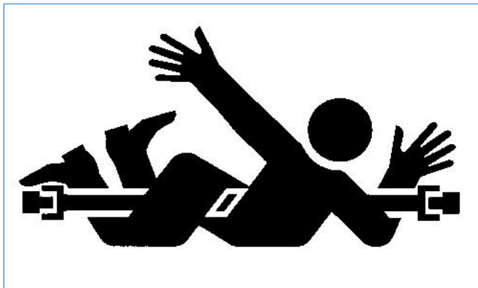
TS1644-UN: Rotating Drivelines