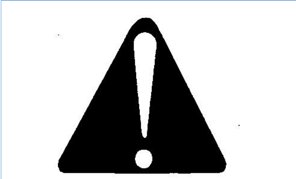
T81389-UN: Safety-alert symbol

This is a safety-alert symbol. When you see this symbol on your machine or in this manual, be alert to the potential for personal injury.